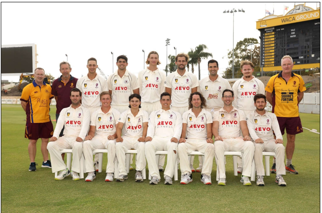
First Grade Premiers 2021-22