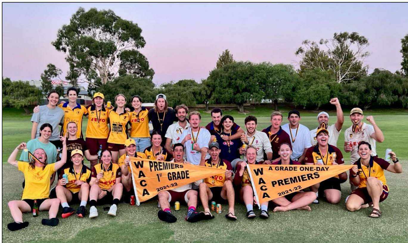
Male and Female Premiers 2021-22, celebrating at Floreat Oval – the home of cricket