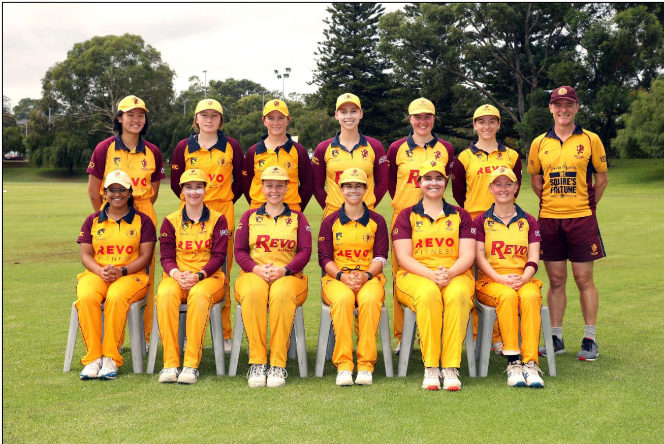
Female A Grade 50 Over Premiers 2021-22