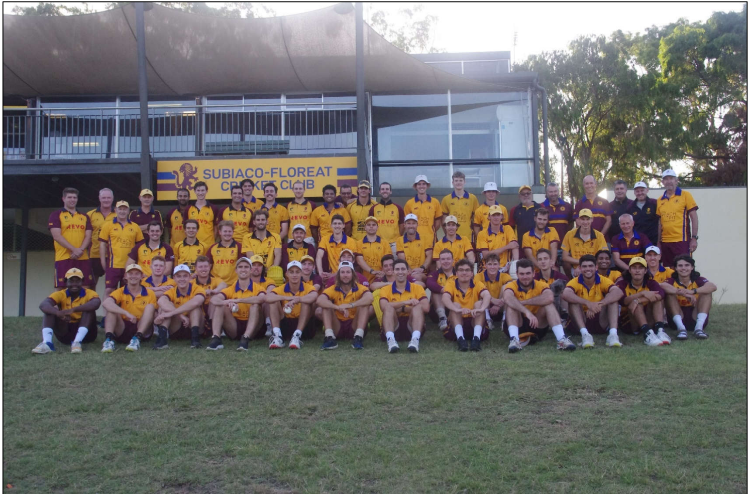
Subiaco-Floreat Cricket Club – Club Champions 2021-22