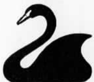
THE SWAN BREWERY