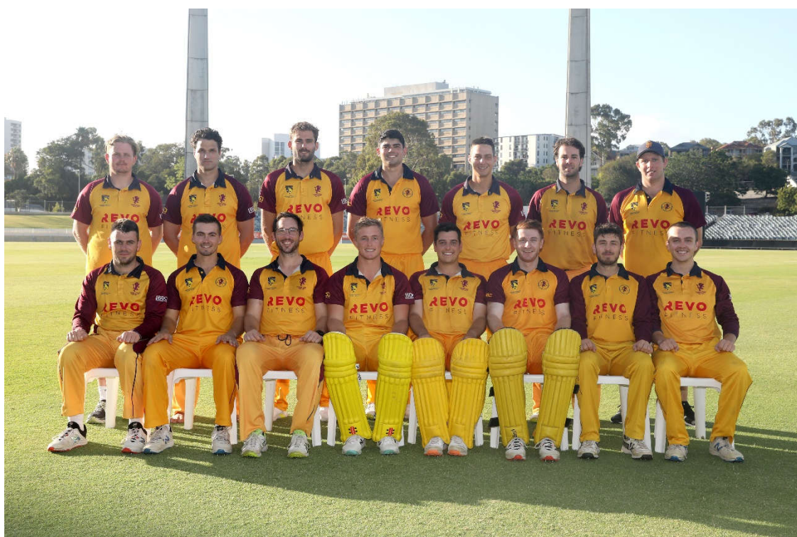
T20 Premier League Grand Finalists 2022-23